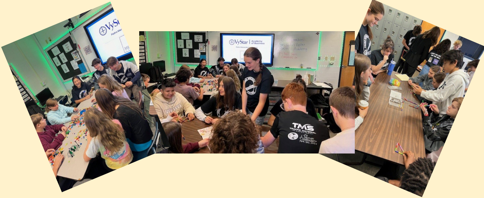
Academy students visit Gamble Rogers Middle School STEM and ICT courses.

Business academy students helped to educate middle school students of the academy opportunities in high school. PMHS business students explained what it is like to be an academy student and participated in various hands-on interactive games geared towards working as a team. Team building is a large part of our courses in this academy.