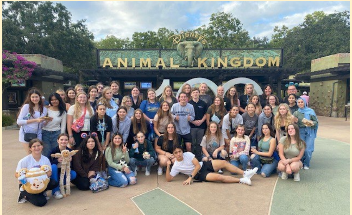
HOSA students were able to enjoy some team bonding on their Animal Kingdom field trip.